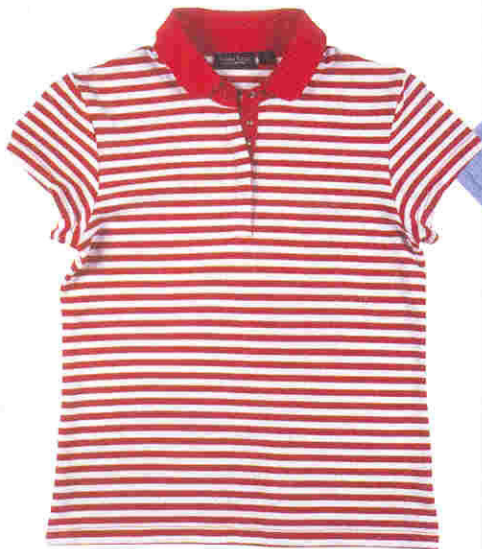
Yarra Trail, $45 Pair this cute red and white striped number with denim.