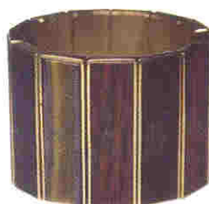
Kenneth Cole, $179.95