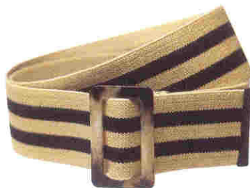
Von Troska, $49