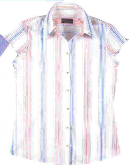
Herringbone, $139 Add neutral-coloured pants or a skirt for an office-friendly outfit.