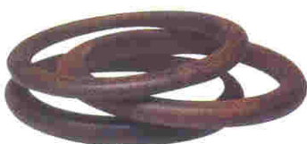
Tribu, $45 for three